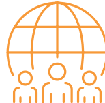
IT & PROFESSIONAL SERVICES